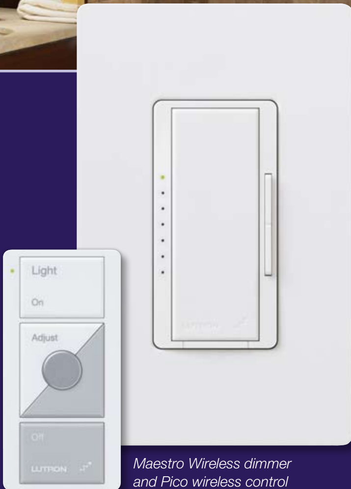
Maestro Wireless dimmer and Pico wireless control