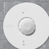
Radio Powr Savr™ wireless occupancy/vacancy sensor